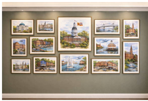
Photo Disclaimer: The image shown above is for inspiration and illustrative purposes only. The actual wall may look different.

Don't forget to submit your best Anne Arundel County photos for AACAR's new lobby display!