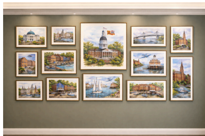
Photo Disclaimer: The image shown above is for inspiration and illustrative purposes only. The actual wall may look different.

Don't forget to submit your best Anne Arundel County photos for AACAR's new lobby display!