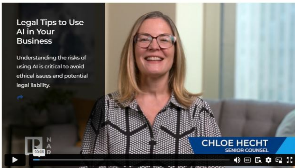
Window to the Law: Legal Tips to Use AI in Your Business

Take advantage of the 2024 Payment Plan by registering today. Please note: All invoices must be settled by November 15th to avoid late fees. Questions? Call the AACAR office at 410-544-4554.